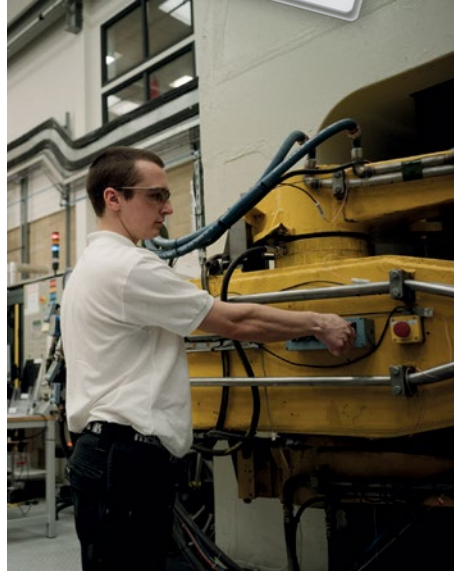
An employee operating one of Element Six's HPHT presses.

diamond's broad engineering potential, making available a material that has not only consistent characteristics but one that can be tailored and specific to an end application.